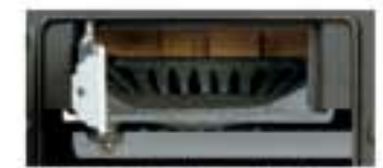
This stove is system with automatic ash elimination and automatic ash discharge. Also it is used to burn wood and coal.