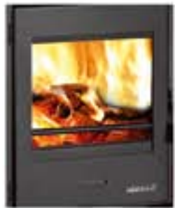
Large glass door for perfect view