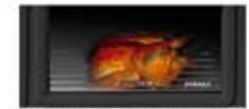
This stove has got white size 310 x 140 x 255 mm oven.