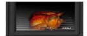
This stove has got with size 310 x 140 x 255 mm oven.