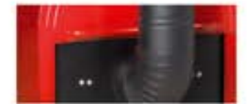
It is from back out system.