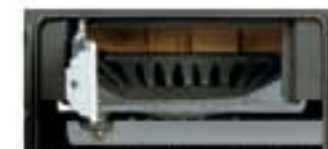
This stove is system with automatic ash elimination and automatic ash discharge. Also it is used to burn wood and coal.