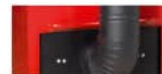
It is from back out system.