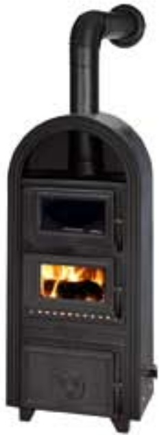
8090 XS OMEGA BLACK