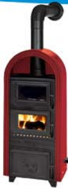
8090 XR OMEGA RED