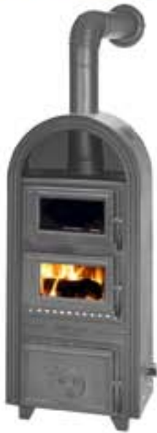
8090 XG OMEGA GRAY