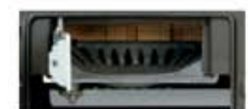
This stove is system with automatic ash elimination and automatic ash discharge. Also it is used to burn wood and coal.