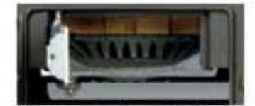
This stove is system with automatic ash elimination and automatic ash discharge. Also it is used to burn wood and coal.