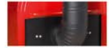
It is from back out system.