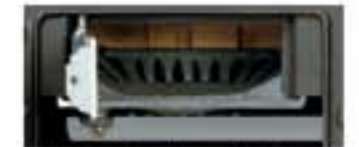
This stove is system with automatic ash elimination and automatic ash discharge. Also it is used to burn wood and coal.