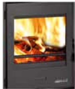
Large glass door for perfect view